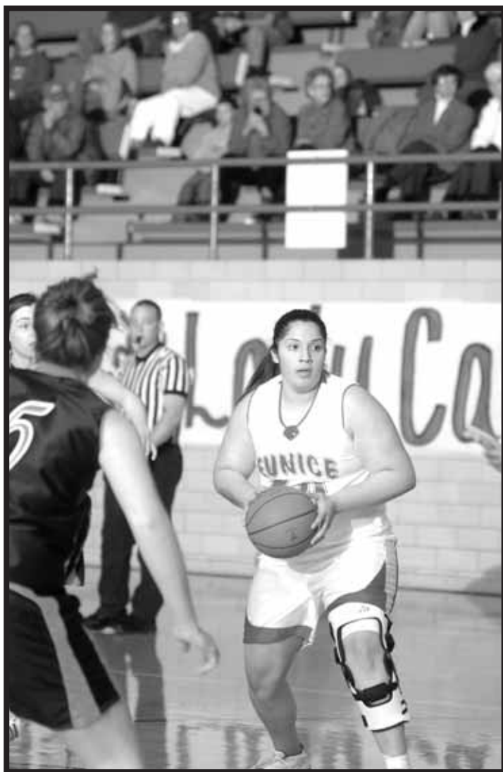
Many Eunice residents enjoy supporting the Eunice Cardinals at local sporting events .

WESTERN HONDA 4502 Lovington Hwy in Hobbs ~ 392-1200