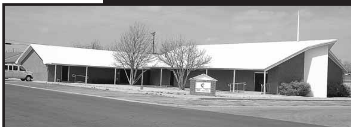
Bottom: Senior citizen Center in Eunice.