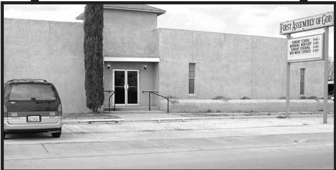
First Assembly of God church on Third Street in Jal.