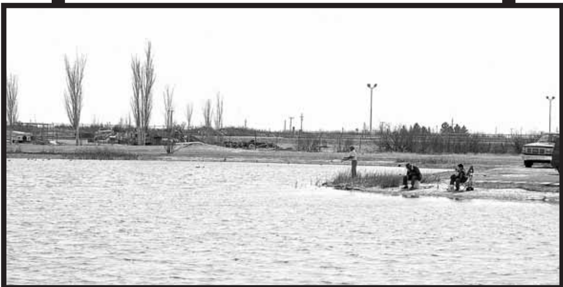
A few men fishing on the banks of the lake.