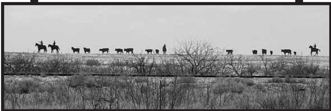
Two-story statues of a cattle drive look normal sized from the highway and greet visitors to Jal.