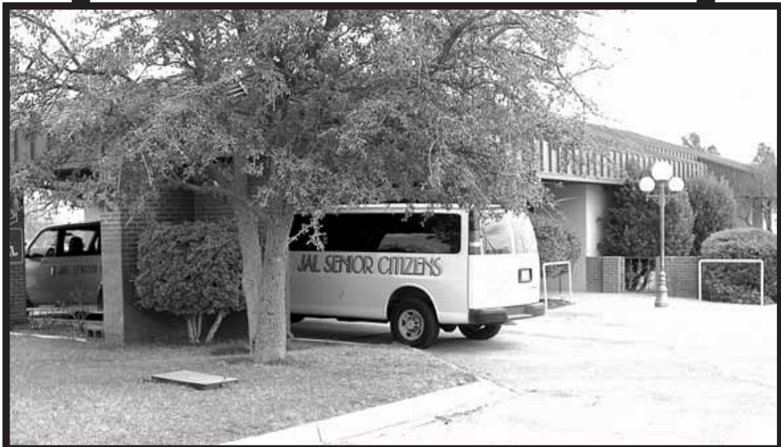
Jal Senior Citizens annex.